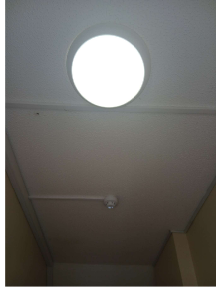
Lighting (Standard and Emergency Lights)