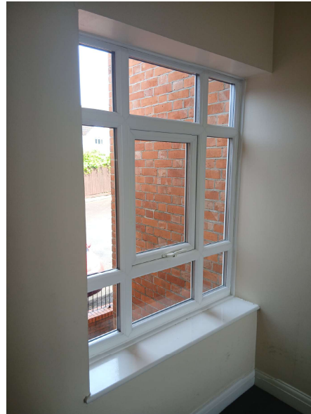
Windows (Communal Windows)