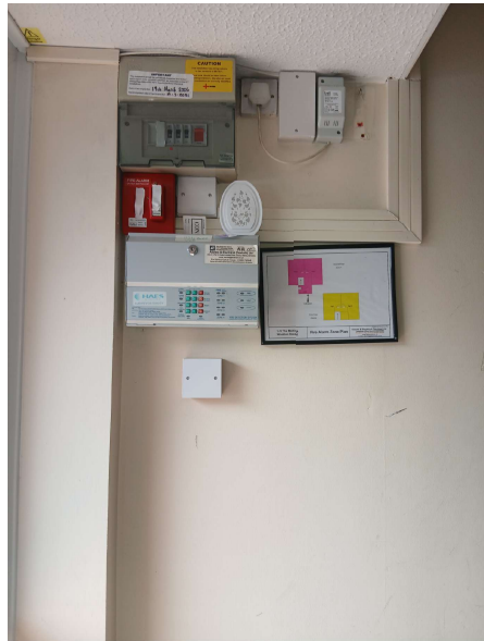
Cupboard Doors (Electrical Cupboard Doors)