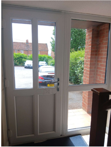
Entrances (Main Doors)